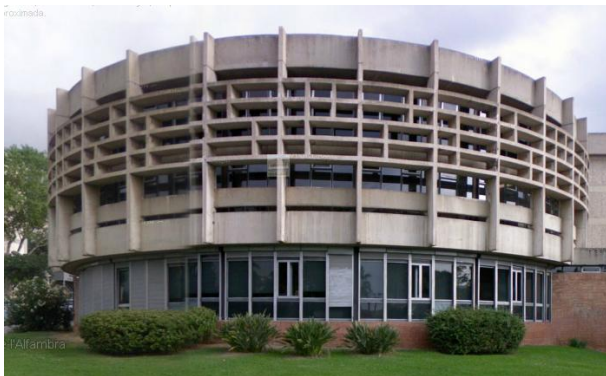
External view of the Aula Magna