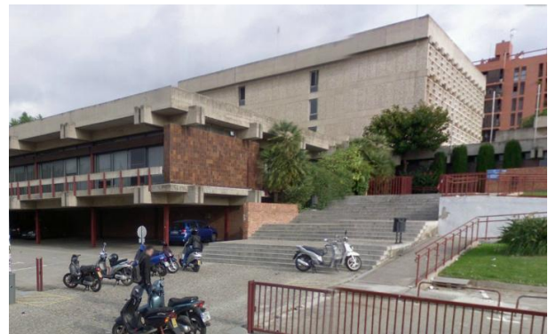
Entrance to the Aula from 690, Diagonal Avenue